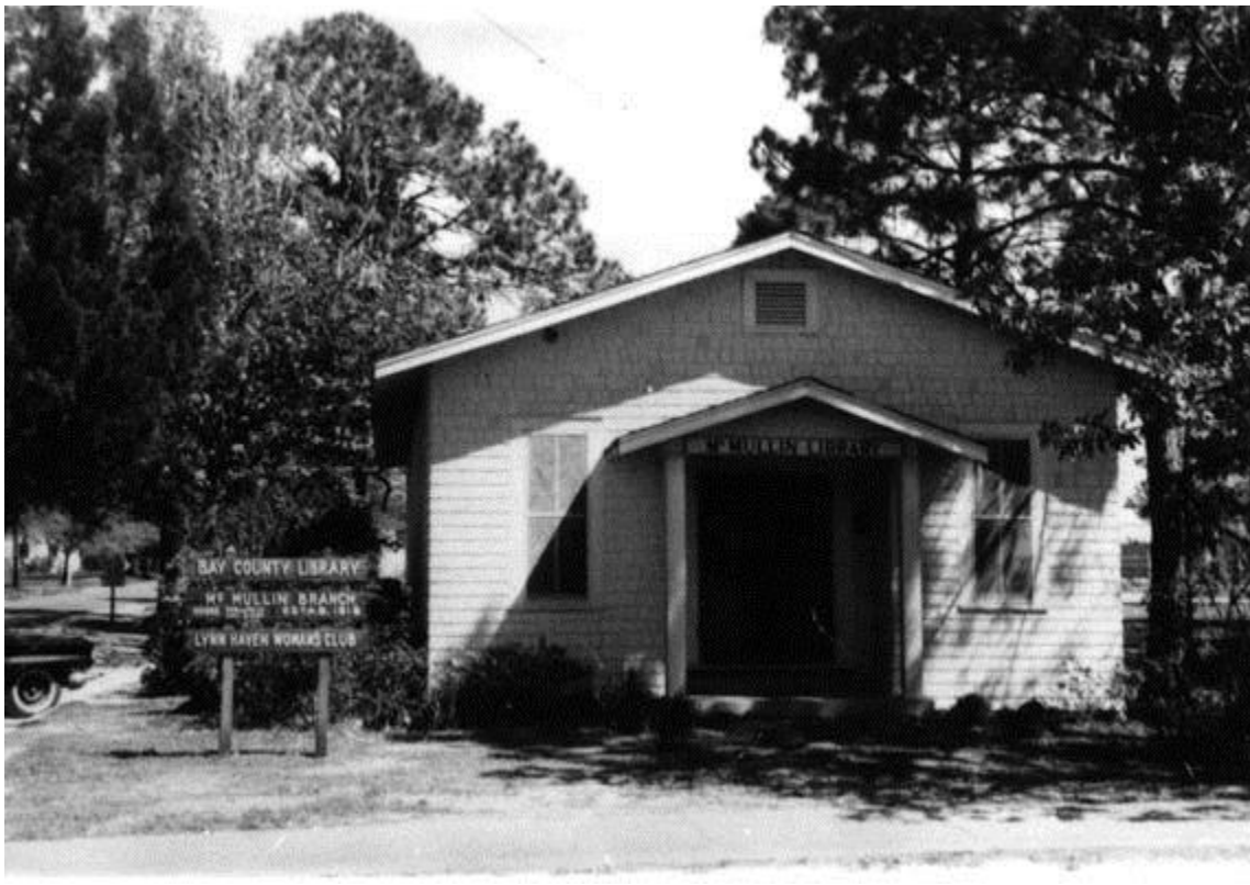
McMullin Branch of the Bay County Library located in Lynn Haven

"Public libraries are an essential part of a complete educational system...Society is required to educate the man of forty just as much as the boy of five...The library helps workers do their work...The library furnishes rest, relief and recreation for tired workers...The public library helps make intelligent citizens...By its cooperative principle, the library makes one dollar do the work of many."