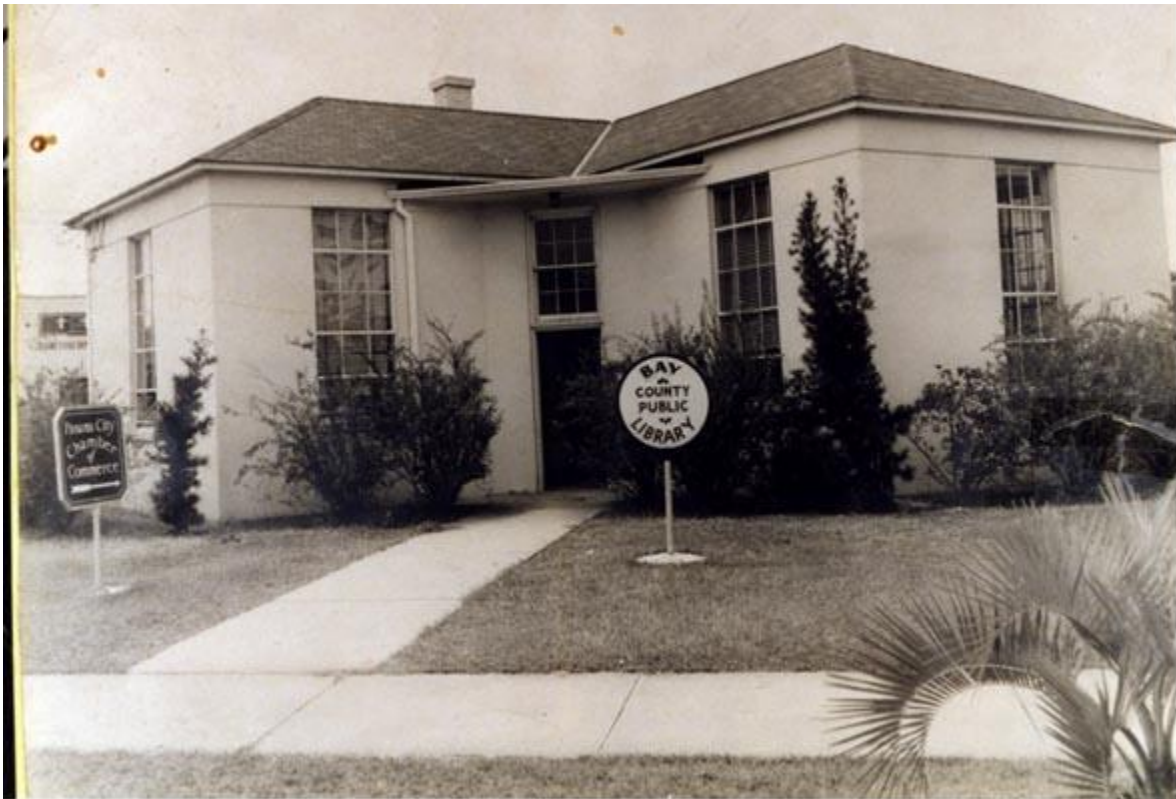
Bay County Public Library located at 411 Jenks Avenue