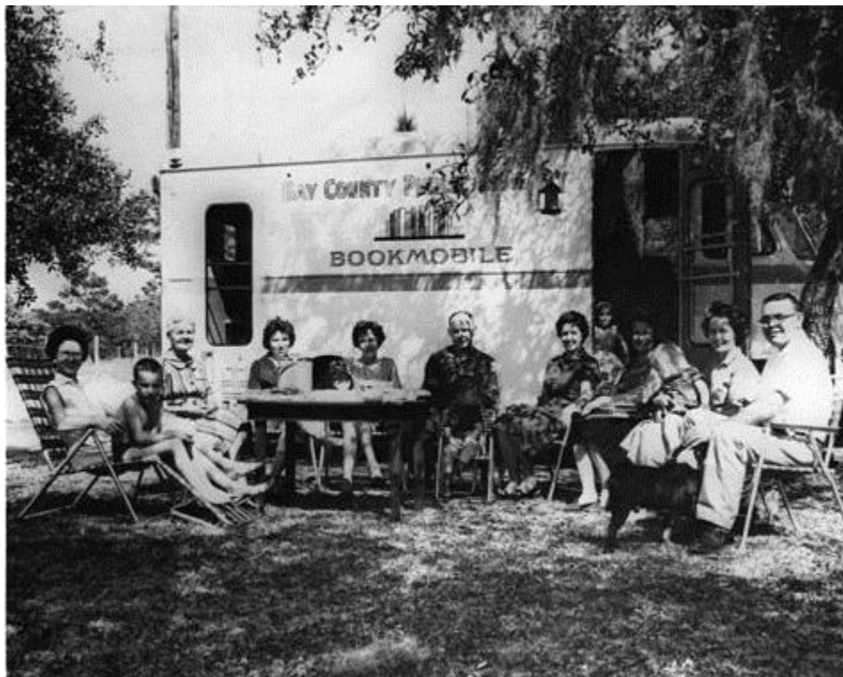
Bay County Public Library Bookmobile at stop.

By 1960, the library had almost doubled its services. We had a bookmobile and the McMullen Library in Lynn Haven became a part of the county system. In September 1960, the Bay County Free Public Library was incorporated as the Bay County Public Library Association, Inc. The Association contracted with the Bay County Board of Commissioners to provide library services to our citizens. In 1962, the library purchased a second bookmobile and the Association contracted with Washington County and formed the Northwest Regional Library System.