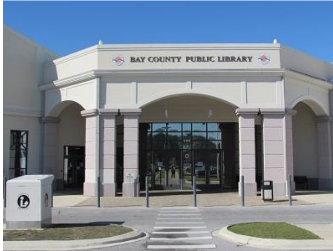
Bay County Public Library at 898 West 11 th Street